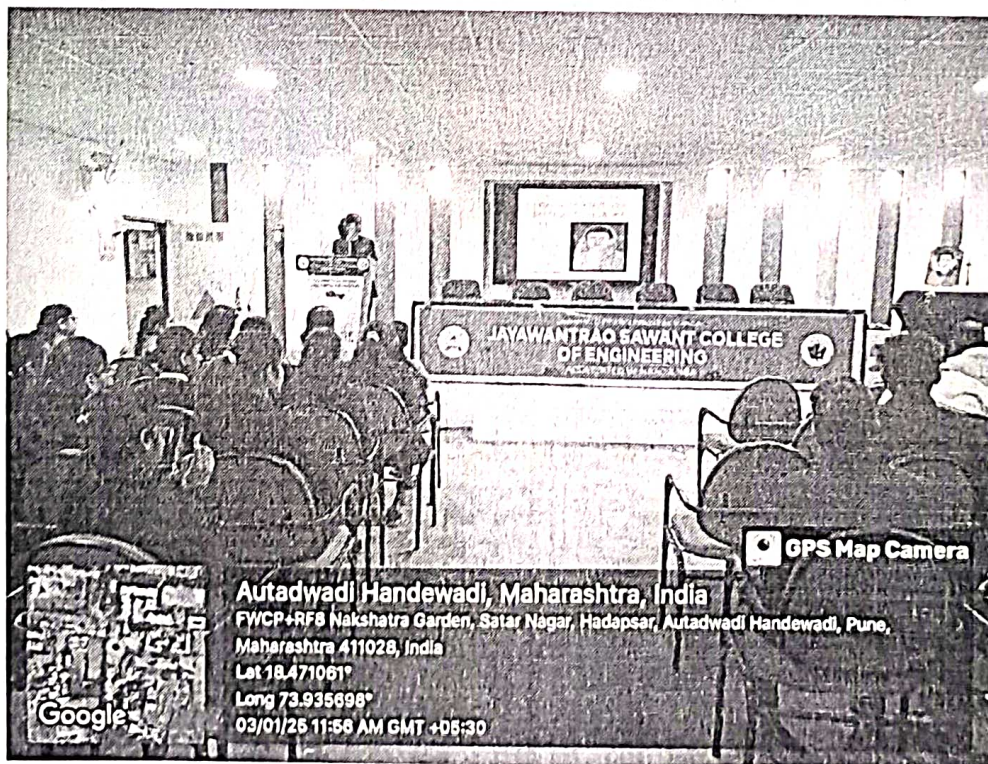
All BCA Staff and Students Attending the Programme