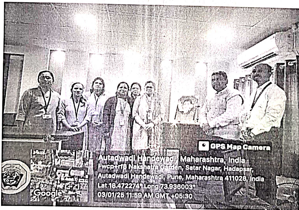
BCA and MCA Department HOD and Staff on the Occasion of Savitribai Phule Jayanti