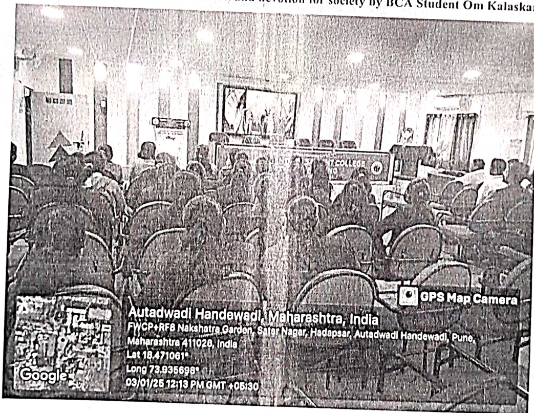
A Inspirational Video Clip on the Life of Savitribai Phule