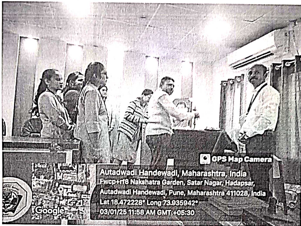
Lightening of lamps and Savitribai Phule Pratima poojan On the Occasion of Savitribai Phule Jayanti